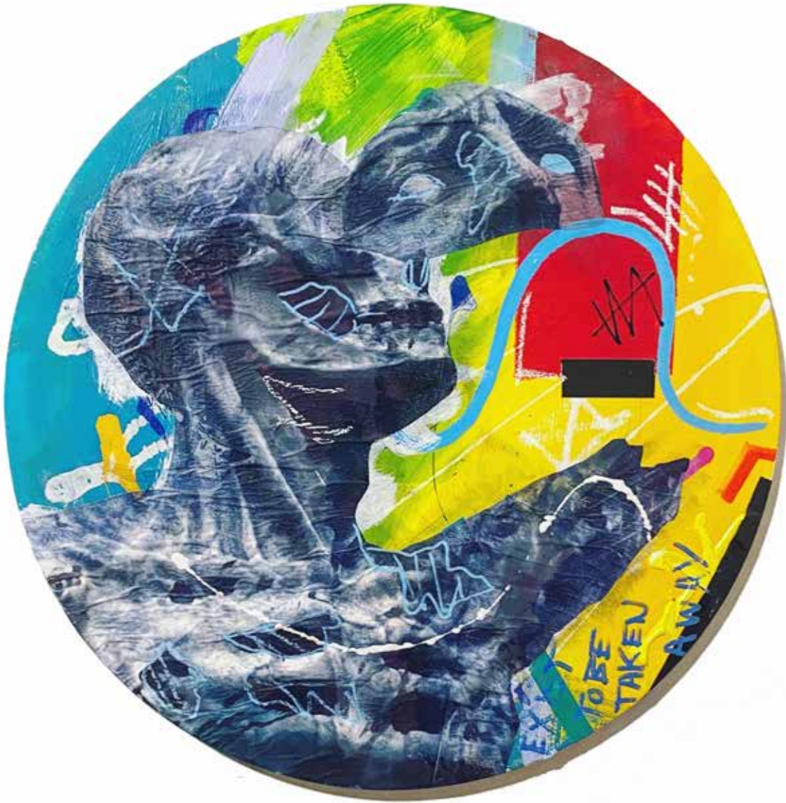
Peter Fortin - "THE FATES I" (2020)