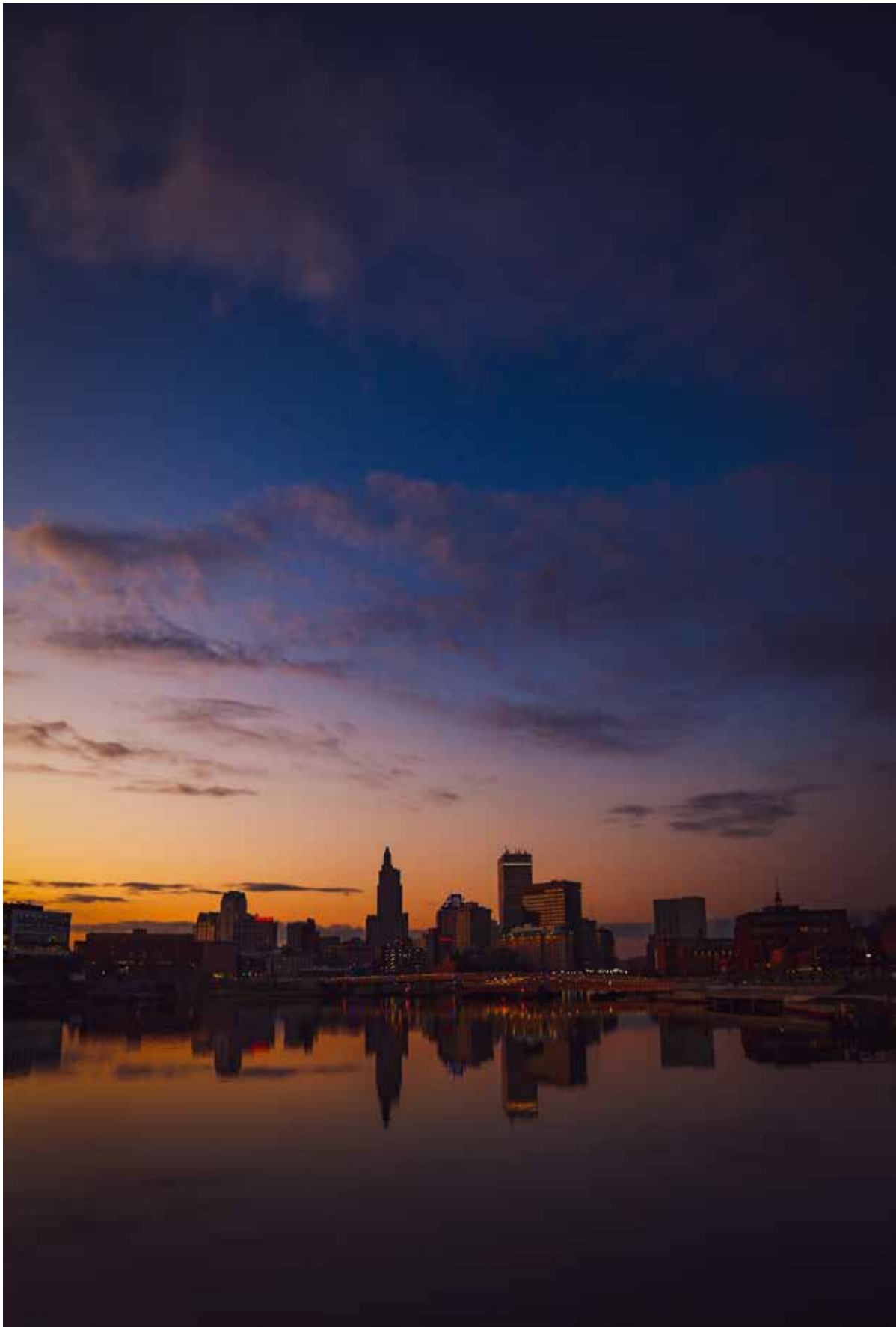
Nathan Gomes - "Creative Capital" (2018)