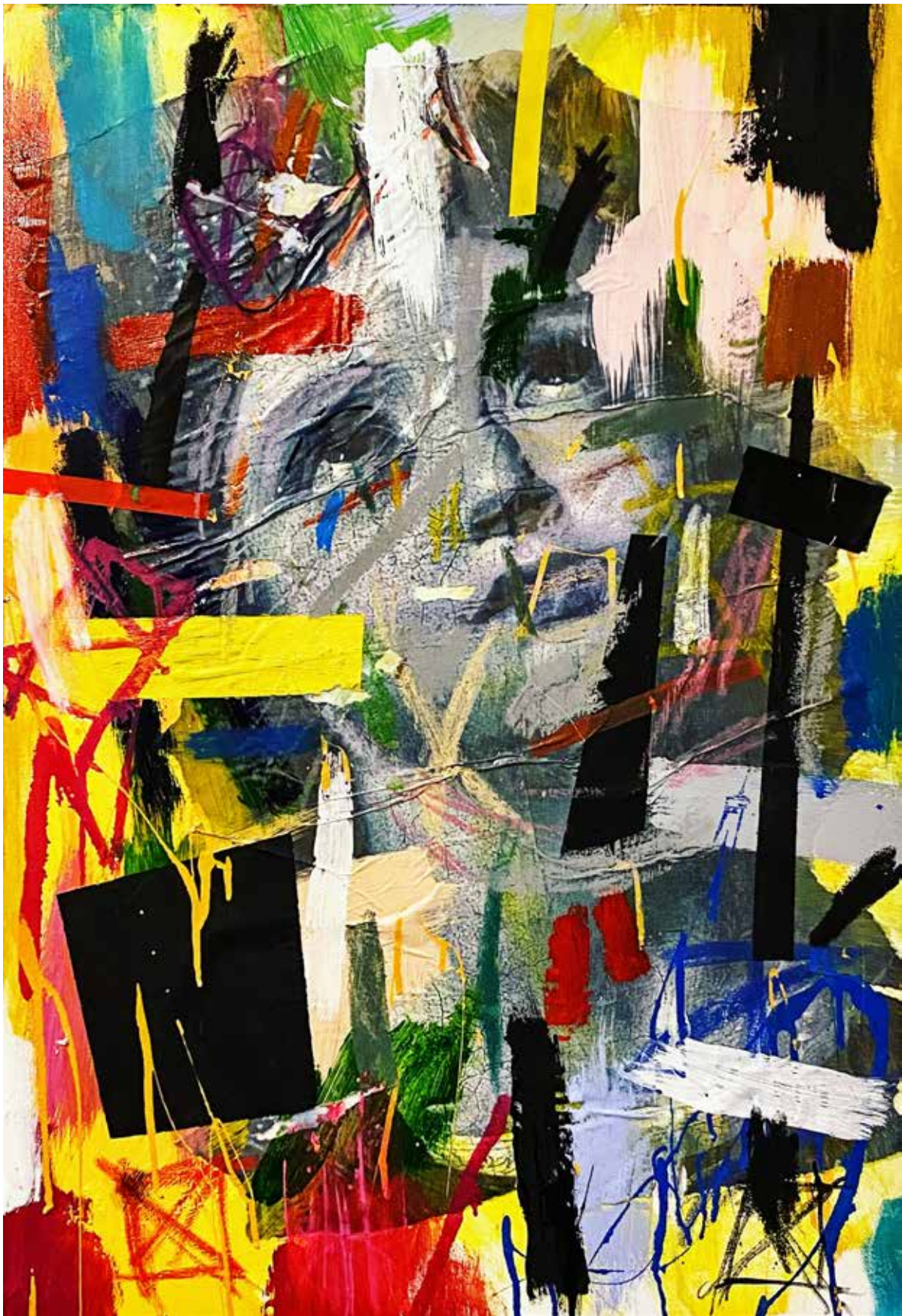
Peter Fortin - "UNTITLED" (2021)