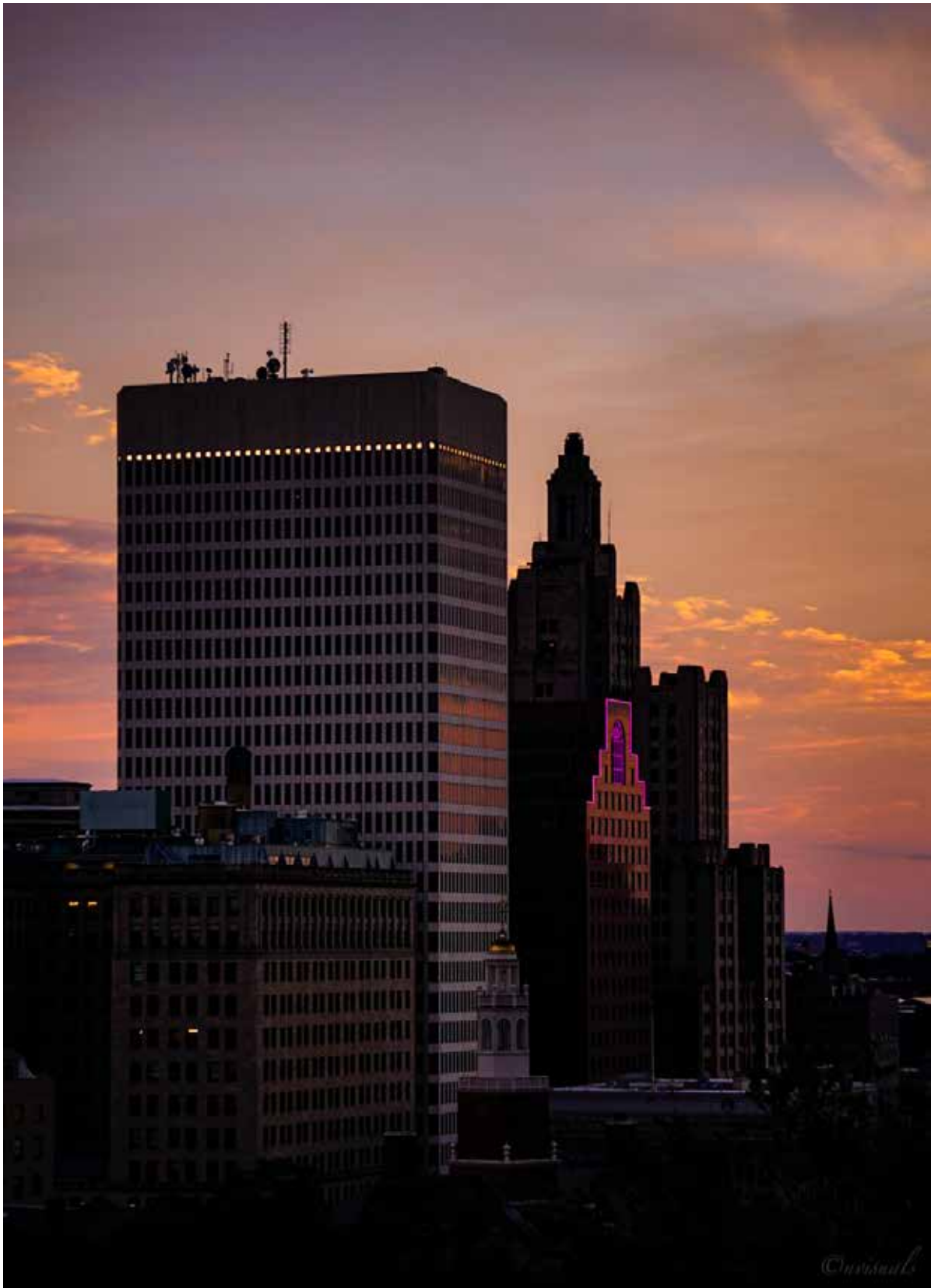
Nathan Gomes - "Big 3" (2020) 8x10" photographic print $75