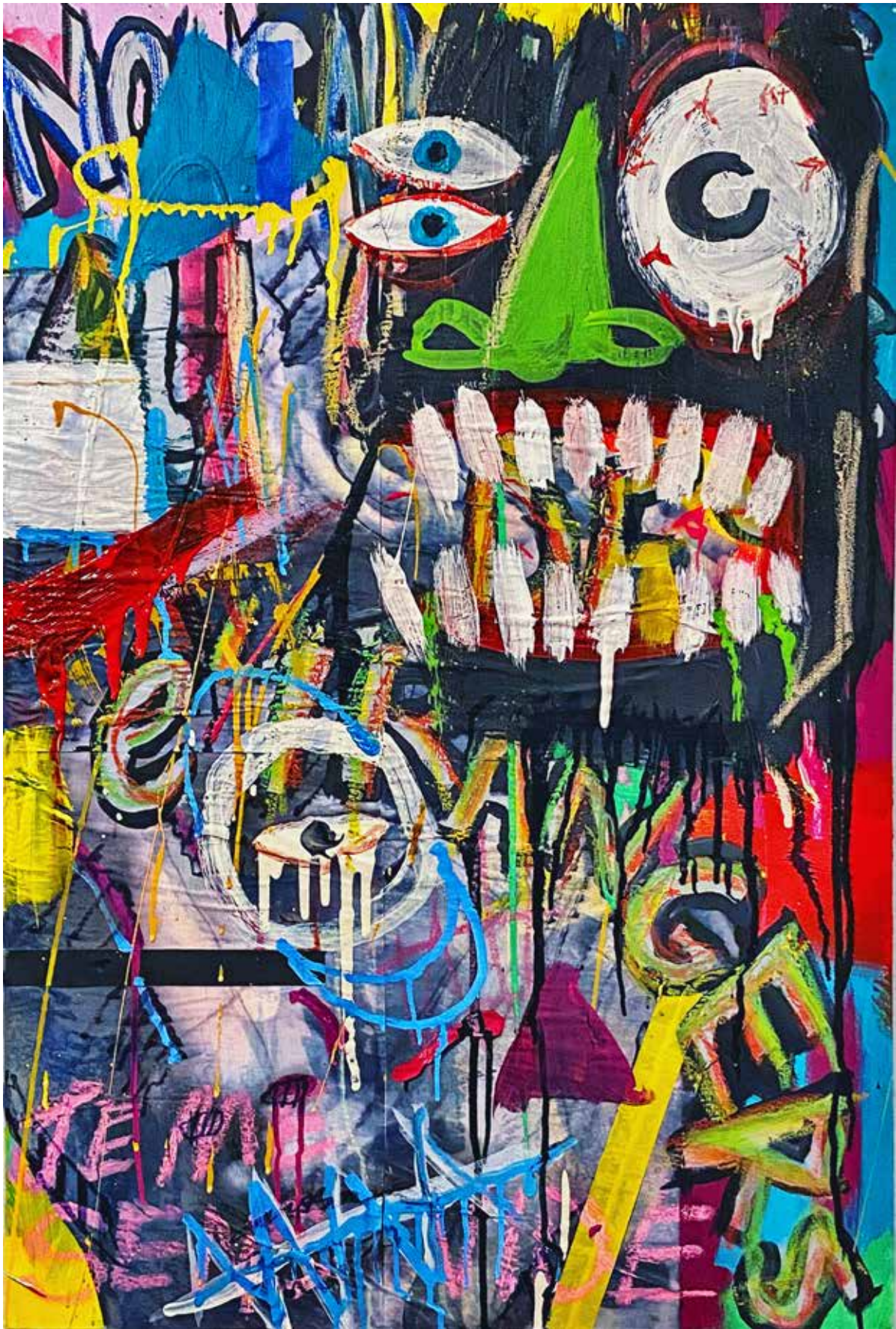
Peter Fortin - "LAFAYETTE" (2021)