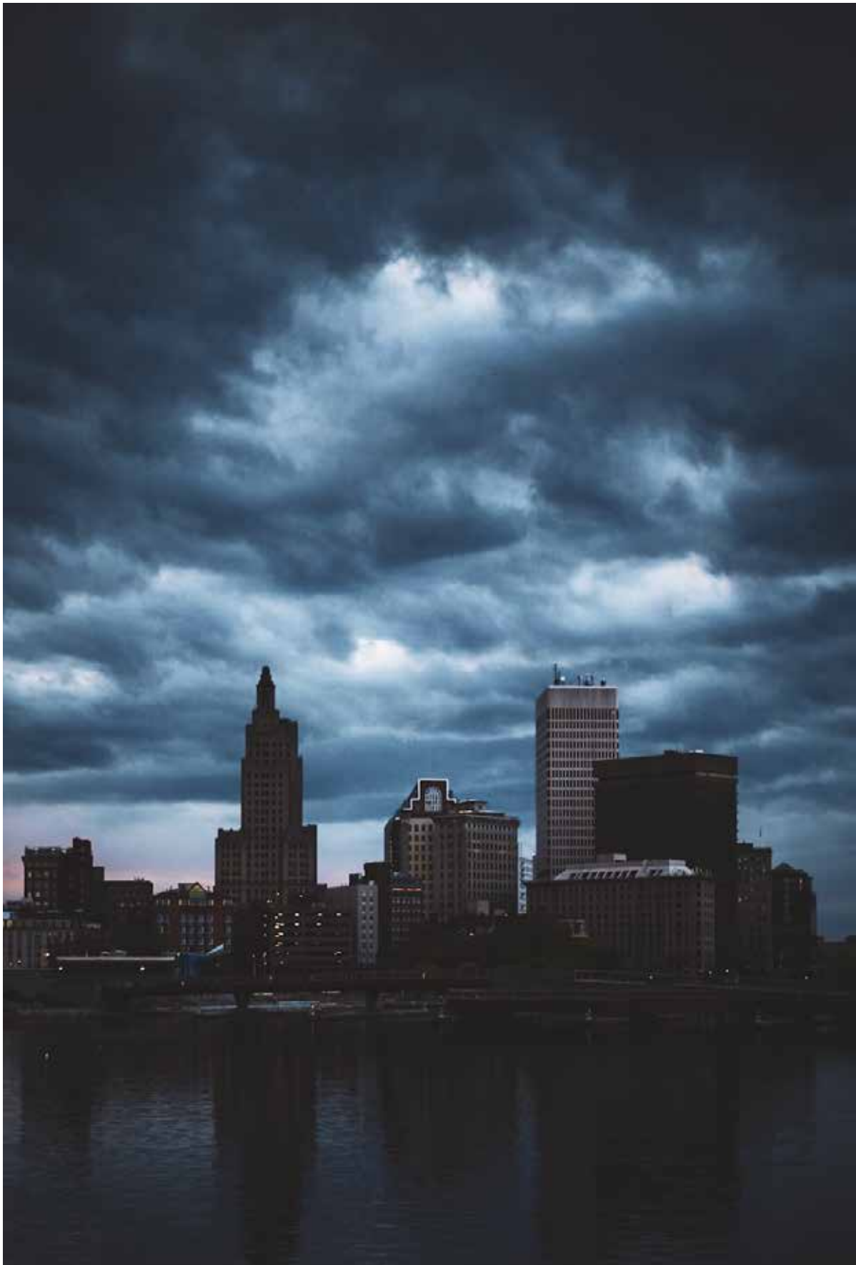
Nathan Gomes - "Before The Storm" (2019)