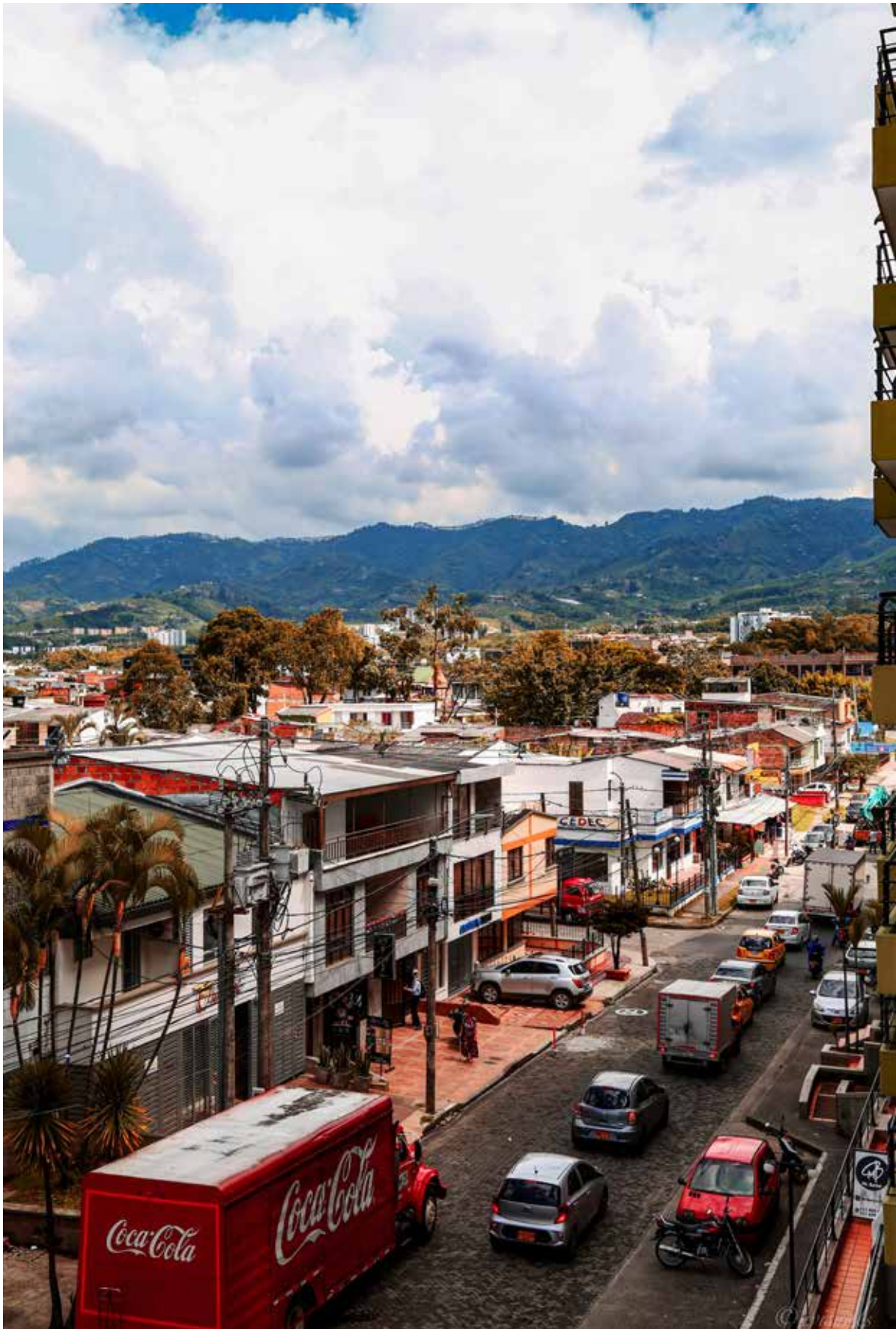
Nathan Gomes - "Colombia" (2019)