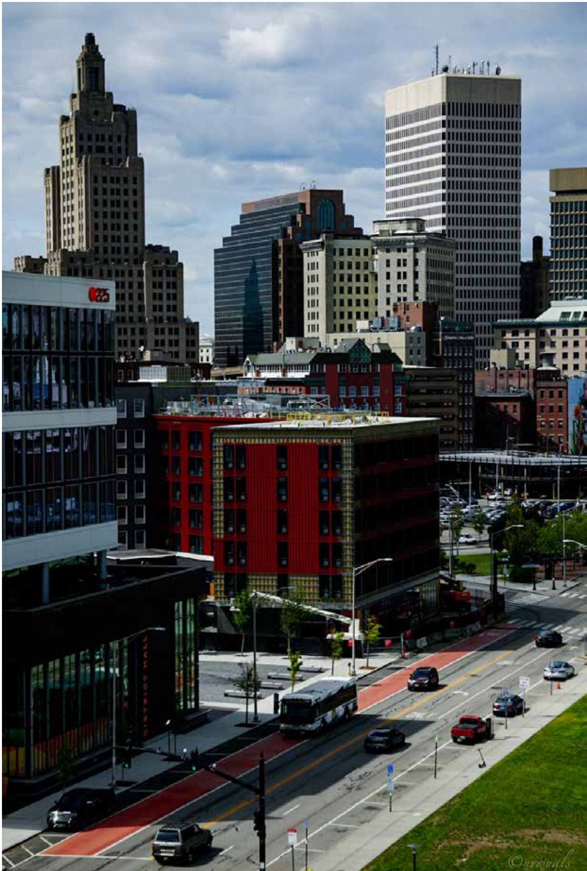
Nathan Gomes - "Tireless" (2021) 8x10" photographic print $75