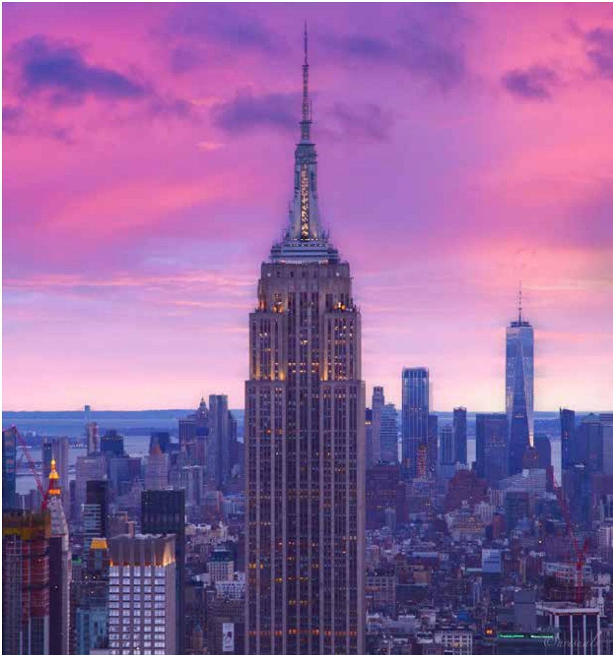
Nathan Gomes - “Empire State of Mind” (2018) 8x10” photographic print $75