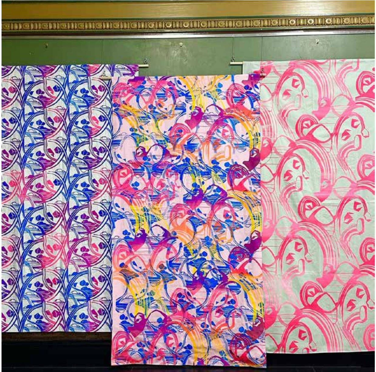
Lara Henderson Cabins, purple on white, 2023 silkscreen printed denim $500