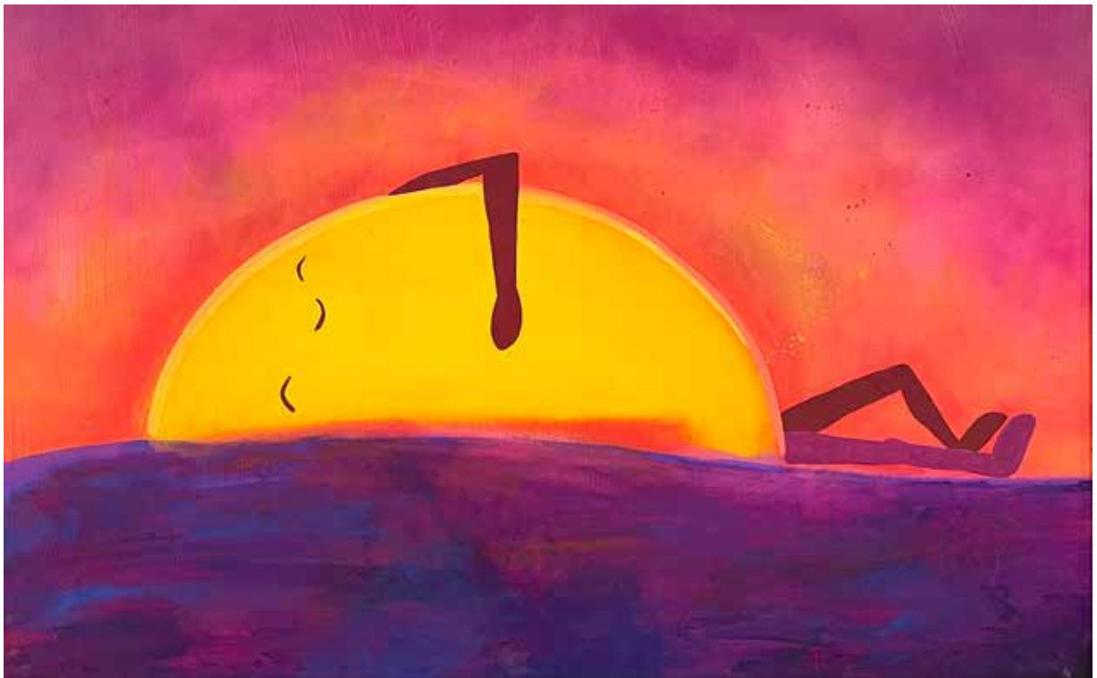
Ryan Dean Atardecer, English - a sunset, 2023 Acrylic on masonite $100