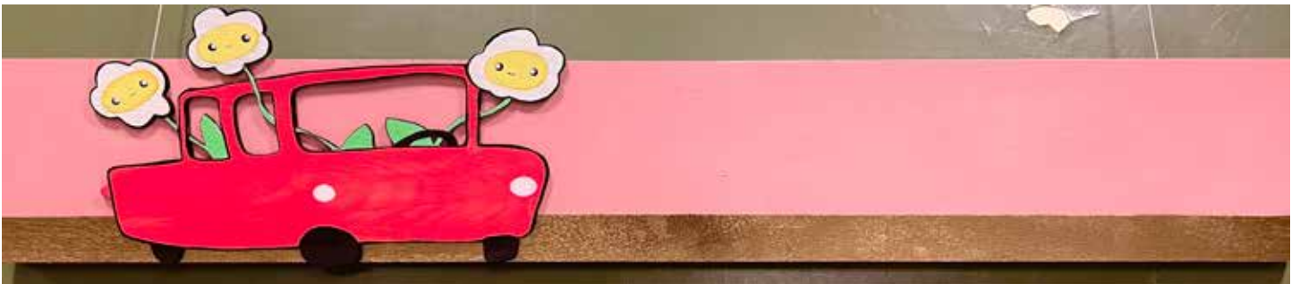
Ryan Dean Road Trippin', 2023 Painted laser-cut wood $100