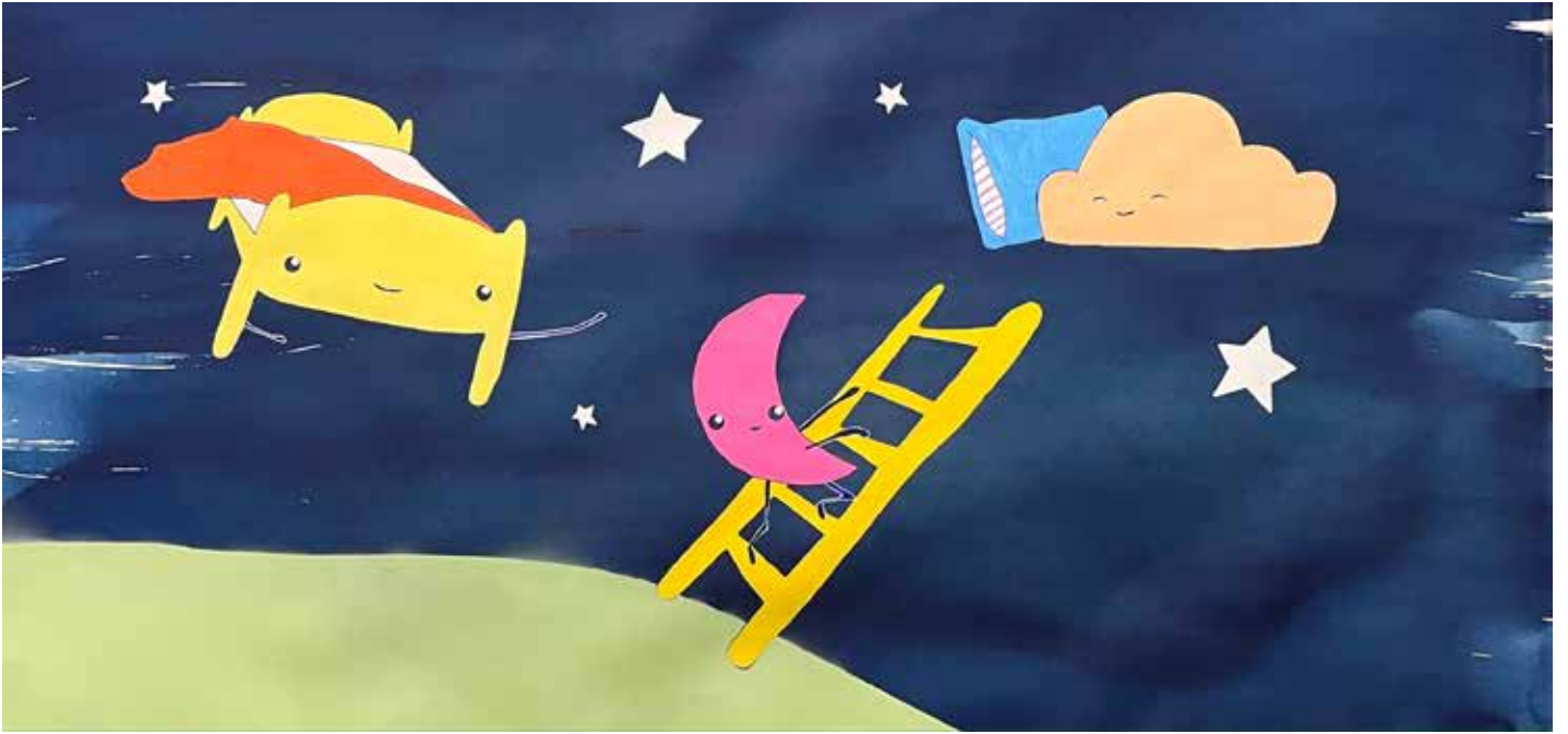
Ryan Dean Noche, English - the night, 2023 Cyanotype and acrylic $100