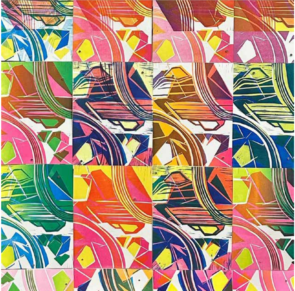
Lara Henderson Cabins, relief print, 2023 Tiled relief prints $50 each