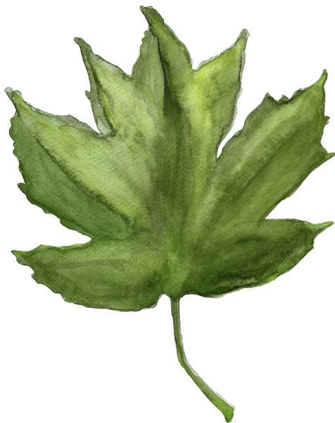
Leaf gouache on paper, 9"x12", $125