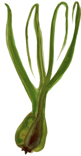
Green Garlic gouache on paper, 9"x12"