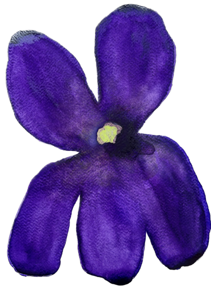
Violet gouache on paper, 9"x12"