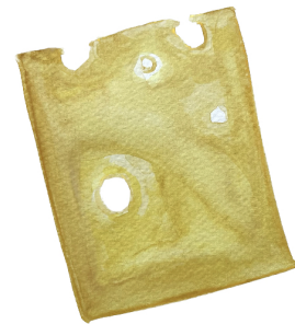
Emmentaler (Swiss Cheese) gouache on paper, 9"x12"