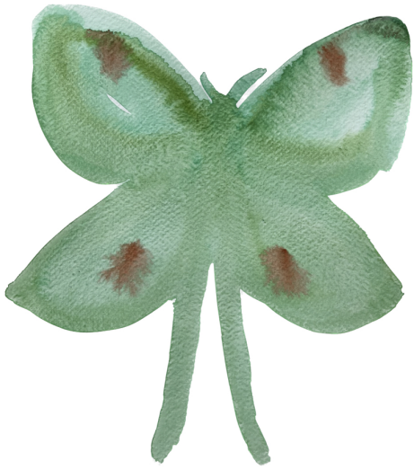
Luna Moth gouache on paper, 9"x12"