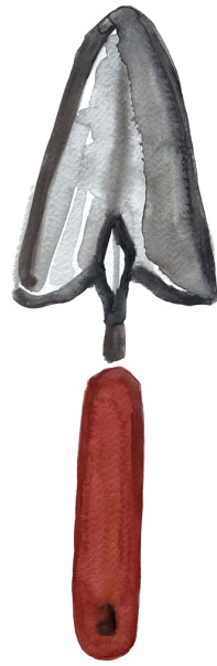
Garden Trowel gouache on paper, 9"x12"