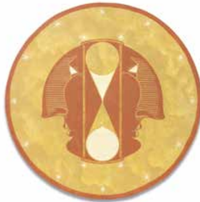
Michael Ezzell - Janus Chronos Acrylic on shaped wood panel $500