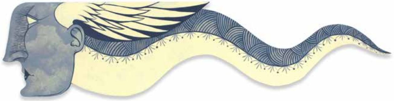
Michael Ezzell - Serpent No.2 Acrylic on shaped wood panel $700